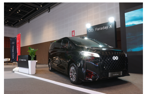
Faraday Future Exhibits at WETEX 2025 and Announces FX Super One Final Launch in Dubai on October 28, Accelerating Smart Green Mobility with the Middle East Third Pole Strategy