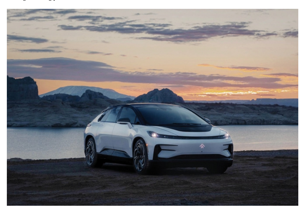
FF 91 Futurist has a target starting price of $180,000.

FF 91 will feature an SAE Level 3 capable autonomous driving system that will deliver multiple ADAS features through a combination of FF's own as well as partners' applications. FF plans to devote resources to autonomous driving research and development and plans to work with partners to deliver full autonomous-driving capabilities in highway and urban driving, as well as parking, across its vehicle lines in the future.