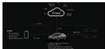
I.A.I Software, Cloud & AI